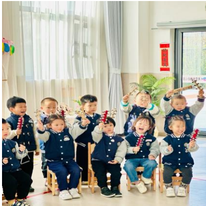
Figure 1 – Application of Orff instrument in music teaching

The integration of art science and technology refers to the organic combination of art and science and technology, and the creation and expression of artistic works with the help of science and technology. In the field of music education, cutting-edge technologies such as virtual reality (VR), augmented reality (AR) and artificial intelligence (AI) can be fully utilized to develop music teaching software and applications to provide students with personalized and interactive learning experience (Figure 2).