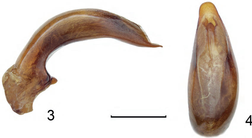
Figs 3, 4. Pseudotaphoxenus kazakhstanicus sp. nov., median lobe of aedeagus: 3 , lateral view; 4 , dorsal view. Scale bar: 1 mm.

1988). Among the members of this group, the new species is easily recognizable by the combination of the following characters: body flat and subparallel, pronotum with very narrow lateral groove and basal foveae short and sharply delimited, parascutellar pore lacking, elytral base not depressed, microsculpture of the dorsum fine, dorsal surface of the tarsomeres finely sulcate basally and the median lobe of the aedeagus with a short subparallel-sided apical lamella.