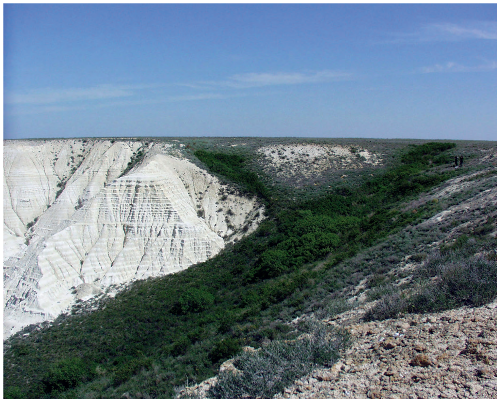
Fig. 5. Habitat of Pseudotaphoxenus kazakhstanicus sp. nov. in Aktolagai Range.

its base narrower, hind angles smaller and not attenuated laterally, and lateral deplanation narrow; in addition, basal portion of each elytron not impressed, microsculpture of the dorsum less developed, and aedeagus with the subparallel-sided apical lamella.