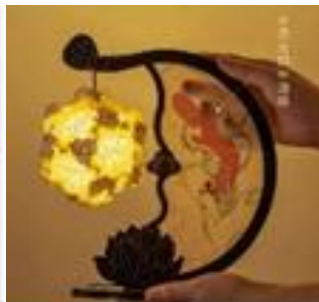
Figure 2.2. Paper lights