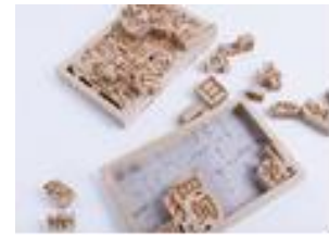
Figure 3.4. Toy

Conclusion. The rich history of Chinese visual elements provides modern industrial designers with endless opportunities to incorporate elements that are relevant and meaningful to the audience. From color to painting, to nature, to patterns and text, designers can draw on traditional Chinese visual elements to create products that not only evoke a sense of history and heritage, but also maintain a sense of modernity and relevance.