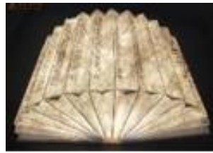
Figure 3.2. Book lamp