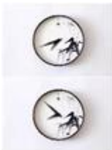
Figure 2.1. Clock

The modern interpretation of traditional Chinese painting is gradually being recognized by the world 0 . Modern industrial designers should actively integrate traditional patterns, realize the innovative application of traditional patterns, promote the development of industry, and radiate the vitality of traditional patterns (Figure 2.4).