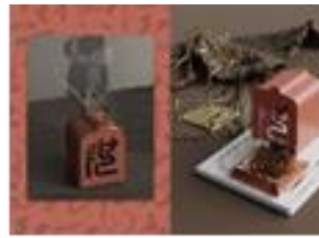
Figure 3.3. Censer