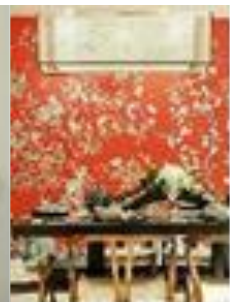
Figure 2.4. Decoration

Chinese character: Chinese characters gradually change from graphics to square-shaped symbols composed of strokes in shape, so Chinese characters are generally called "square characters" (Figure 3.1). Chinese characters have the characteristics of integrating image, sound and meaning. This feature is unique in the world's writing, so it has a unique charm.