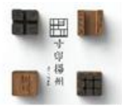
Figure 3.1. Table ornaments

(Figure 3.3). In addition, Chinese characters can add cultural elements and design connotations to enterprises in terms of products and advertisements (Figure 3.4).