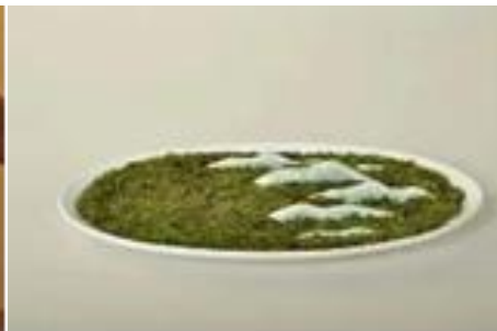
Figure 2.3. Mountain plate