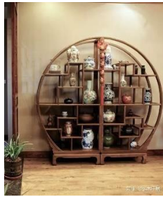
2-2 Bogu Shelf