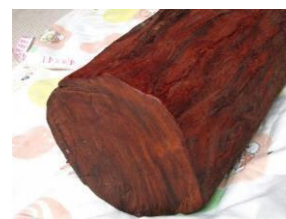
1-3 Red sandalwood

The selection of materials for Ming-style furniture was careful: The brilliant colours of Scentedrosewood, with yellow and brown, its fine and beautiful grain and the characteristic scent of the wood; Phoebe zhennan wood is a precious wood unique to China, It is orange yellow in color, with a faint aroma of camphor wood, the grain is clear and richly varied, like many golden lines etched into the wood, which glows beautifully in the sunlight, beautiful to the extreme. Red sandalwood is an particularly hard and heavy wood, with a deep purple-black colour, after polishing, the surface can show a satin-like luster. The craftsmen chose these woods because they are strong and durable, easy to preserve, on the other hand, they all have a beautiful natural grain, fragrant wood smell.