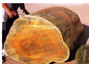
1-2 Phoebe zhennan wood