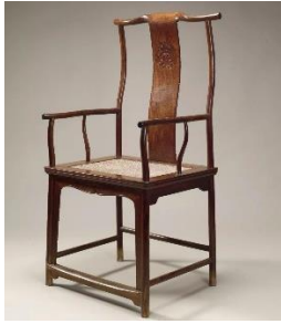
2-1 Official hat chair