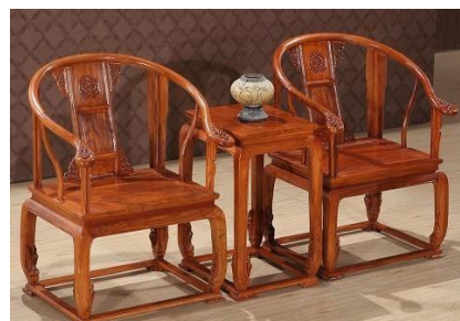
Figure 4-2 Furniture with textures