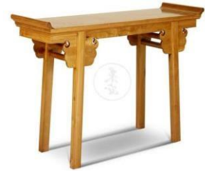
2-4 long table

The unique shape of Ming-style furniture: The designers of furniture are mostly people with a lot of knowledge and very elegant gentlemen. After they design the furniture patterns, they are then handed over to the woodworkers with good craftsmanship, so the shape of the furniture pursues the elements of point, line, surface and body collocation, and the structure is scientific and reasonable, in line with the principle of ergonomics(refer with: Figure 2-1); The exterior outline of the furniture has no complicated decoration, and uses lines to form rich variations, giving users a strong sense of curve beauty(refer with: Figure 2-2); the panel decoration mainly reflects the unique style through the texture of the wood itself, carved patterns with implied meanings(refer with: Figure 2-3), inlays and auxiliary components(refer with: Figure 2-4), etc.