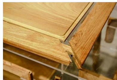
Figure 3-2 Zanbian method

The exquisite craftsmanship of Ming-style furniture: The process of furniture is mainly adopted mortise and tenon joint structure [in Chinese it is Sunmao structure (refer with: Figure3-1)] and Insert a piece of wood into the rim with grooves on the inside [in Chinese it is Zanbian method(refer with: Figure3-2)]. Using these processes to make full use of the characteristics of wood, many ingenious ways of joining have been discovered. They also reduce the use of nails, reducing damage to the wood and extending the life of the furniture.