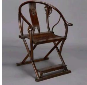
2-3 lap chair