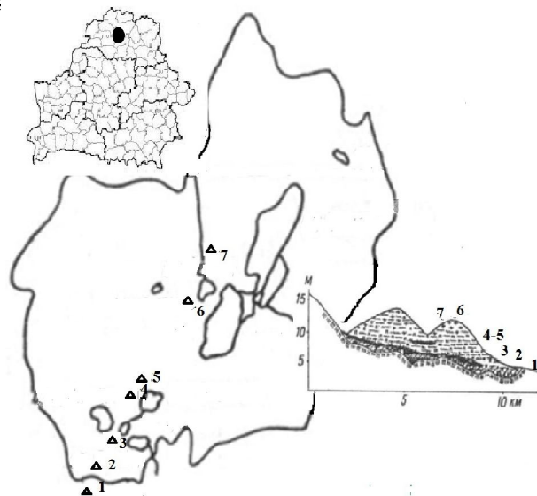
Fig.1. Location of the sampling sites in the peat bog Yelnia