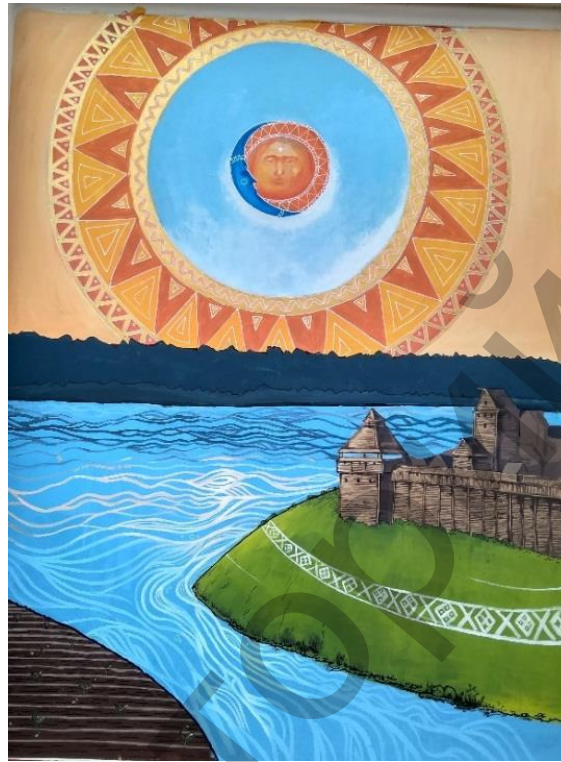
Picture 1. The central part of the triptych